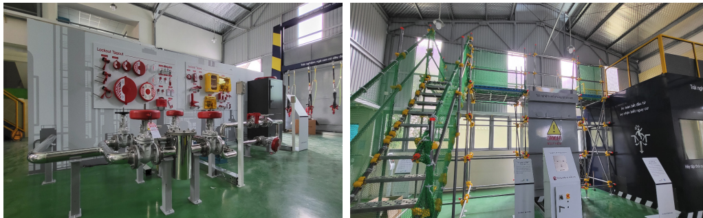
Hands-on training and practice equipment at the Occupational Safety and Health Training Center in Ho Chi Minh City, Vietnam