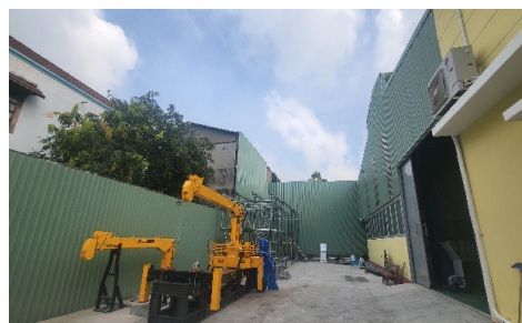
The Occupational Safety and Health Training Center in Ho Chi Minh City, Vietnam