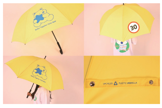
Safety umbrellas made from upcycled safety helmets