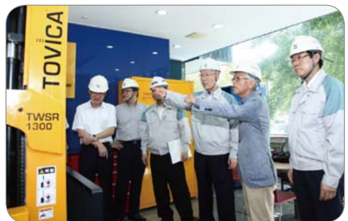
Mr. Baek (3 rd from the right) and representatives from the labor, business, private, and government sector are sharing opinions during a visit to a local business to find practical accident prevention measures

Amid a series of large-scale industrial accidents, the government (the Ministry of Employment and Labor) plans to pay more visits to local businesses to collect opinions and to come up with a comprehensive accident prevention plan thorough meetings and discussions in which members from the labor, business, private and government sector all participate.