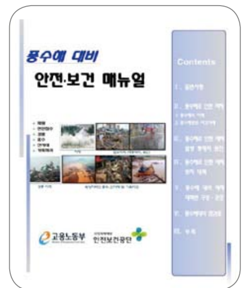
Cover of the manual

An official from KOSHA said, "Mindful of typhoon Maemi in September 2003 that caused massive personal and property damages, construction companies should set up accident prevention plans and emergency response measures as they are especially vulnerable."