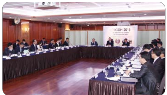
NSC members are sharing their ideas on better preparation on ICOH 2015 Congress