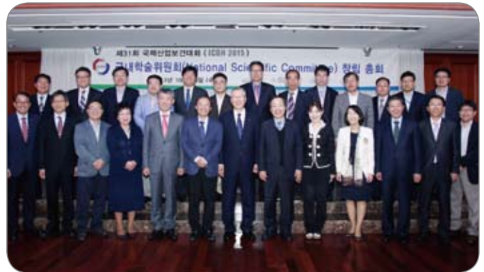
NSC meeting participants are smiling with the hope of successful ICOH 2015 Congress.

Since its first meeting in 1906 in Milan, Italy, ICOH was hosted in Europe 20 times, and North America 4 times. Korea is the third Asian country to host ICOH following Japan and Singapore.