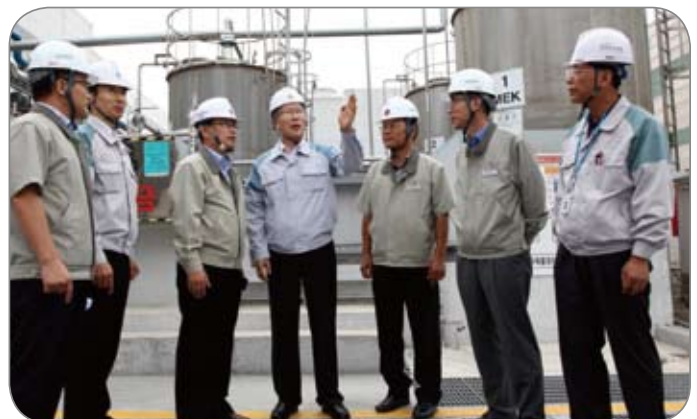
Mr. Baek (4 th from the left) is discussing prevention measure in a visit to LG Chem Chungju factory.

“Recent large scale accidents would have been prevented if basic safety measures had been followed,” Mr. Baek said. “Prevention of occupational accidents takes a strong commitment of employers and a sense of responsibility to follow safety and health measure among employees. These meetings are to find practical measures based on the voices of each industry.”