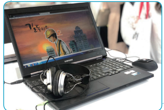
Scenes from demonstration of e-learning safety & health training during the 2019 National OSH Week