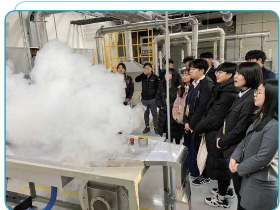
Hands-on training on local ventilation system