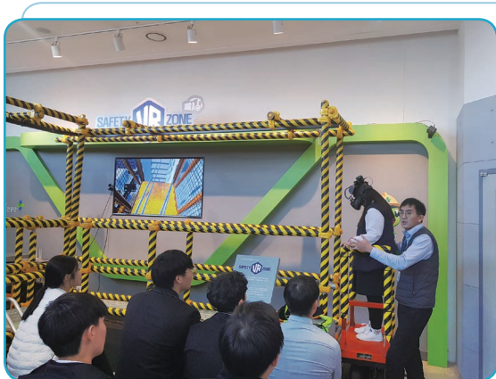
Experience of falling at construction sites via Virtual Reality (VR)