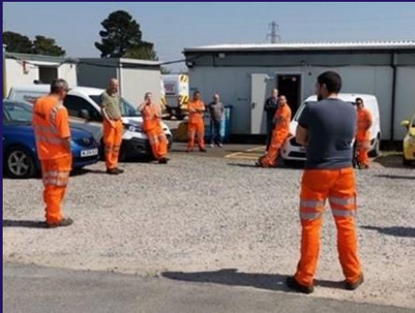
Social distancing during meetings outdoors

Objective: To reduce transmission due to face-to-face meetings and maintain social distancing in meetings.