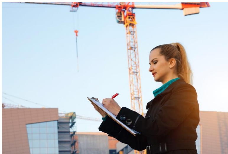
Visitor signing in

Encouraging visitors to use hand sanitiser or handwashing facilities as they enter the site.