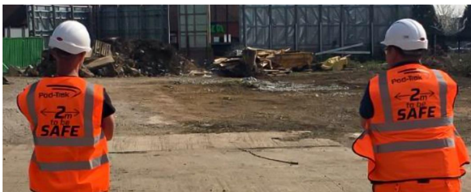
Uniform signage for workers to provide clear messaging